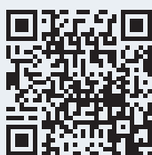
Scan the QR code to watch

Scan the QR Code to hear a recording of the symphony by the Boston Philharmonic on YouTube.