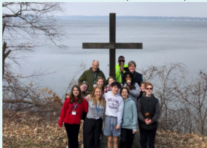
Middle School Retreat at the Daycholah Center in Ripon, WI