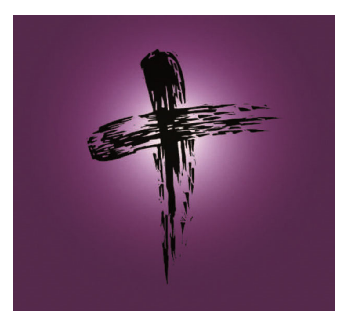
February 22, 2023 7:00 pm